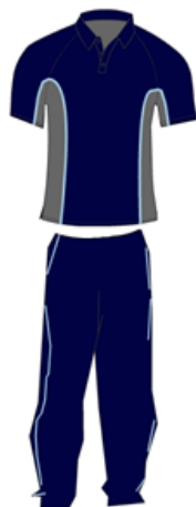
Boys Polo and Track Pant